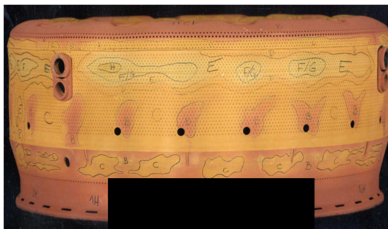
Figure 1.4: A combustion chamber of Turboméca

In real configurations, direct numerical computations are beyond reach. This is mostly due to the large number of perforations (approximately 2000) and to their small characteristic lengths (diameter of a perforation 0.5mm; spacing 5mm) with respect to the wave length (0.5m approximately). In this project, we are interested in giving a rigorous explanation to the approximate transmission classically used to model the multiperforated plates.